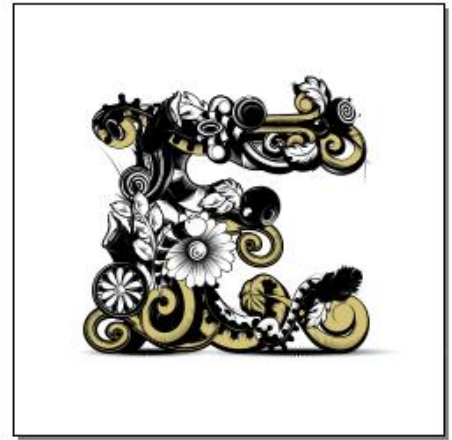
PHUNK | H.O.P.E.. (Golden) | 2012 | Silkscreen on canvas with diamond dust | 70 x 280cm (70 x 70 cm x 4 panels)