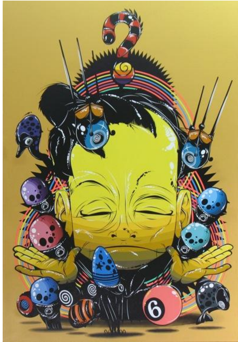
PHUNK | Daydreamer 7 | 2012 | Acrylic on Canvas | 200 x 140cm

ART SEASONS Singapore | Beijing | Jakarta