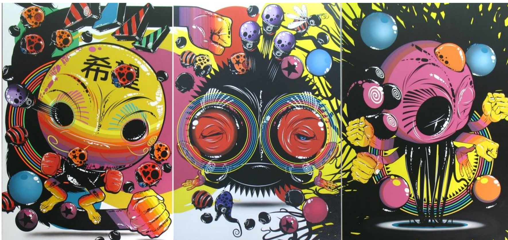
PHUNK | Daydreamer 3 (Triptych) | 2012 | Acrylic on Canvas | 200 x 140cm x 3 panels

ART SEASONS Singapore | Beijing | Jakarta