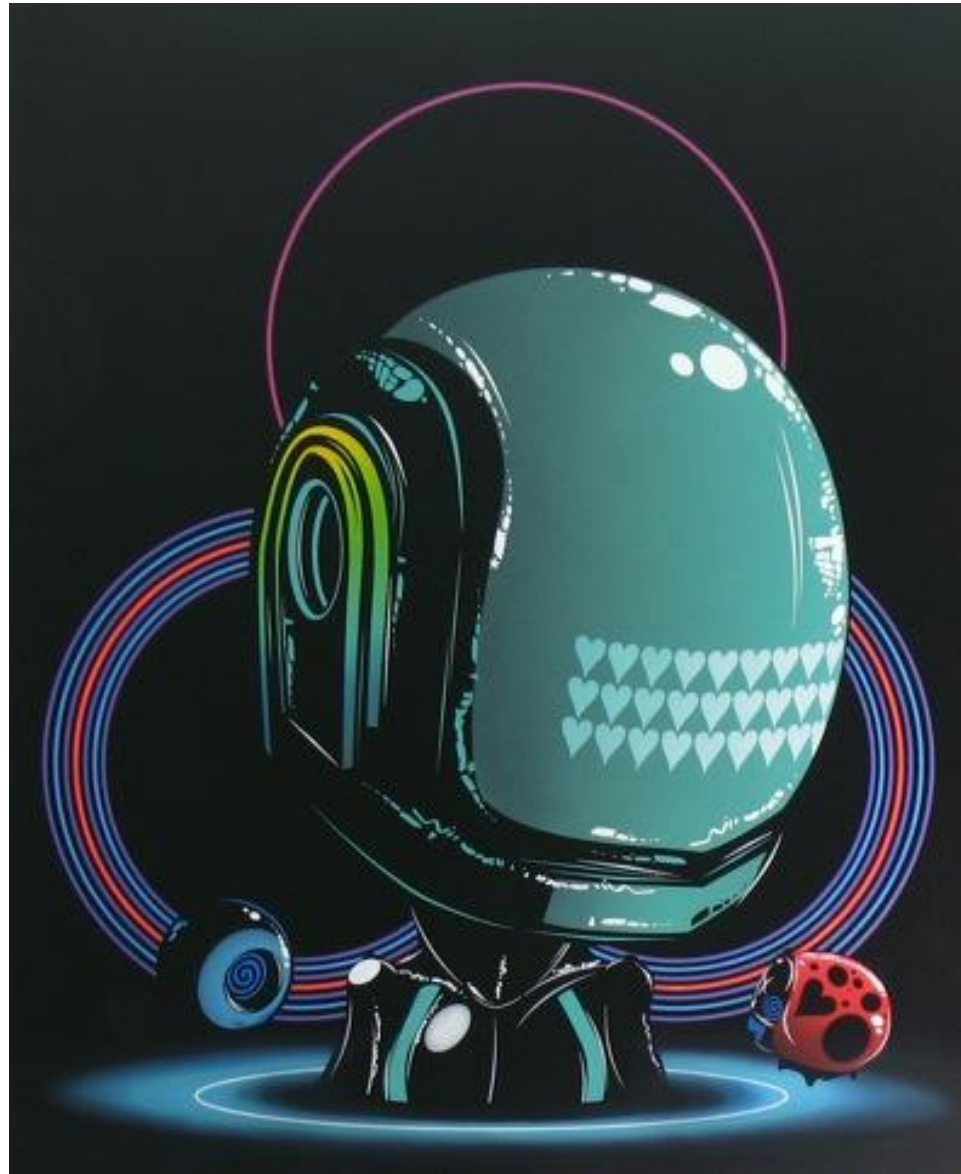
PHUNK | Daydreamer 5 | 2012 | Acrylic on Canvas | 170 x 140cm

ART SEASONS Singapore | Beijing | Jakarta