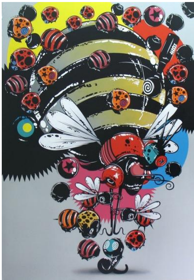
PHUNK | Daydreamer 6 | 2012 | Acrylic on Canvas | 200 x 140cm

ART SEASONS Singapore | Beijing | Jakarta