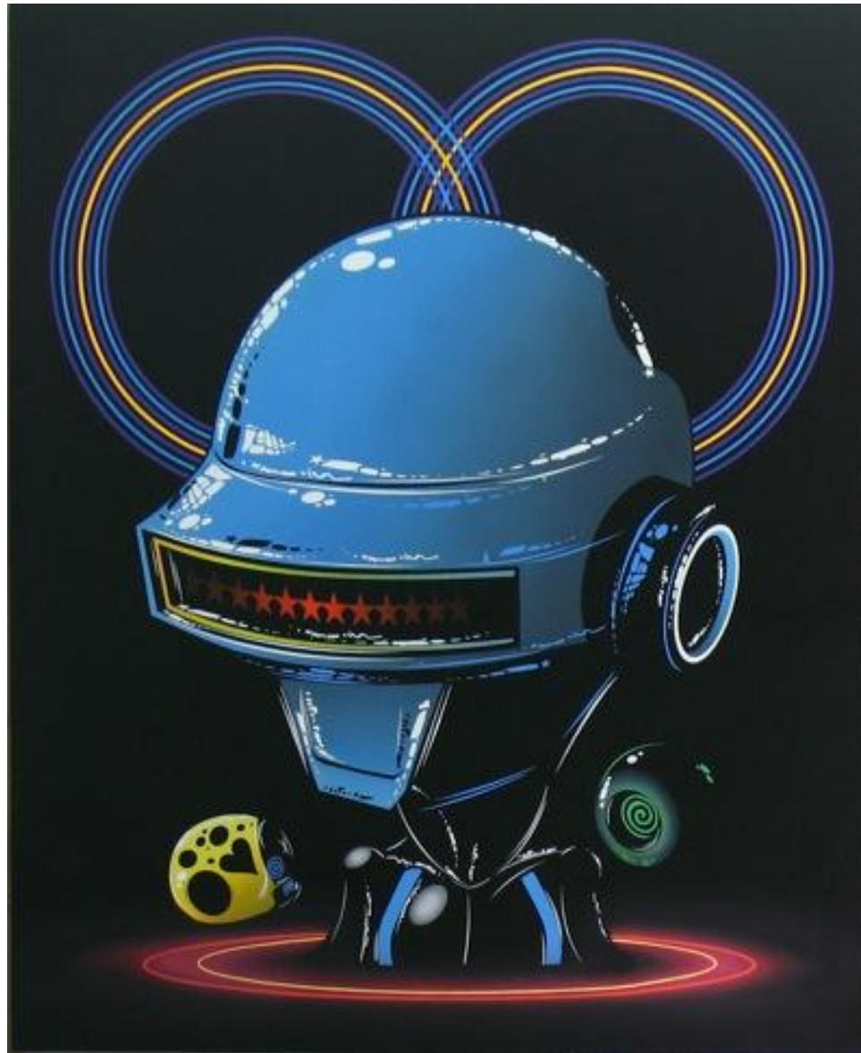
PHUNK | Daydreamer 4 | 2012 | Acrylic on Canvas | 170 x 140cm

ART SEASONS Singapore | Beijing | Jakarta