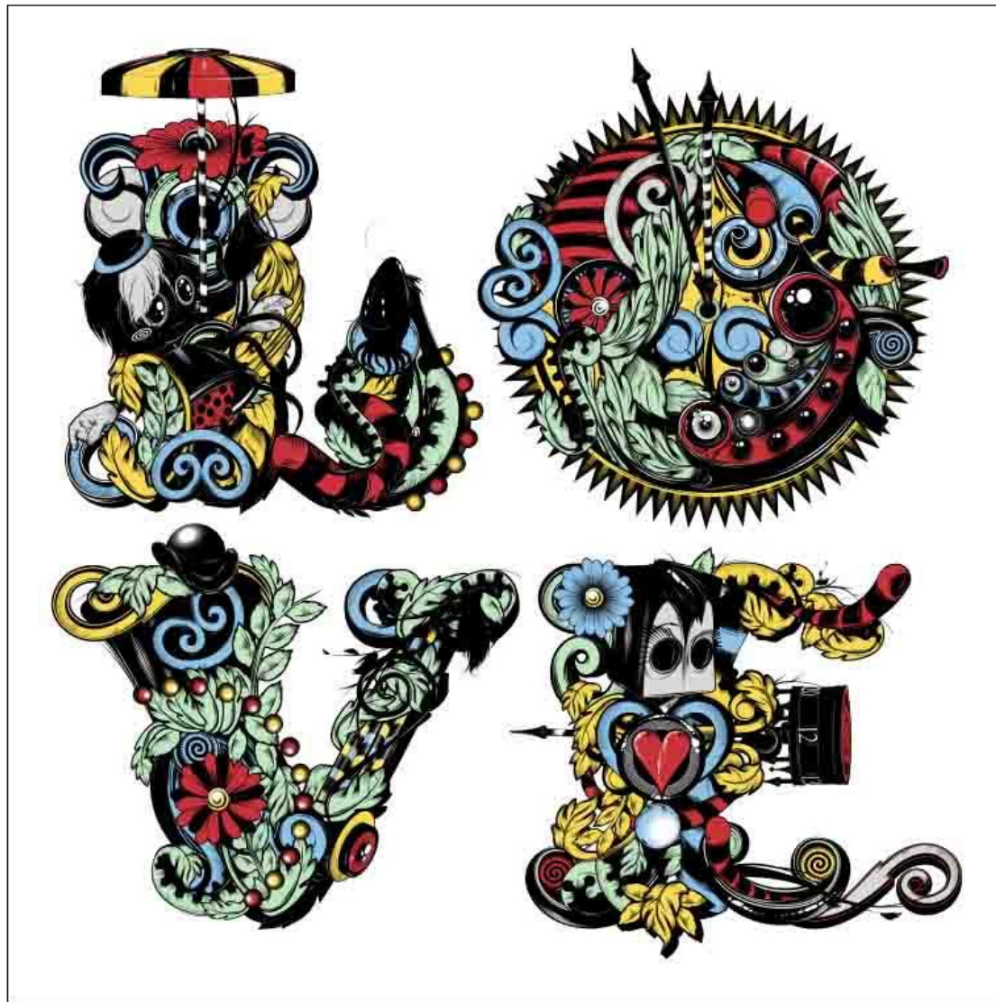
PHUNK | L.O.V.E. (Summer) | 2012 | Silkscreen on canvas with diamond dust | 120 x 120 cm

ART SEASONS Singapore | Beijing | Jakarta