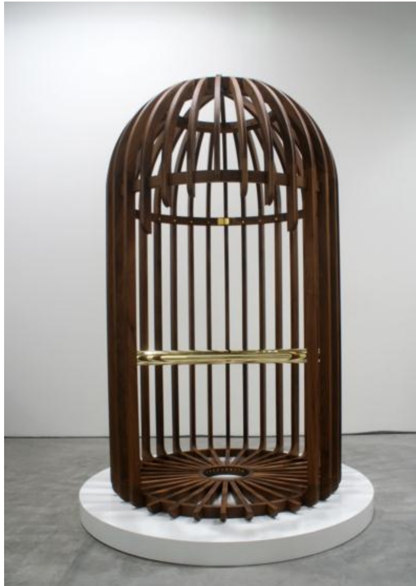
PHUNK & Nathan Yong | King of Dreams | 2012 | Solid American black walnut, polished brass tube with laser etching | 213 x D: 120 cm | Edition of 3 (each piece is individually etched)

ART SEASONS Singapore | Beijing | Jakarta