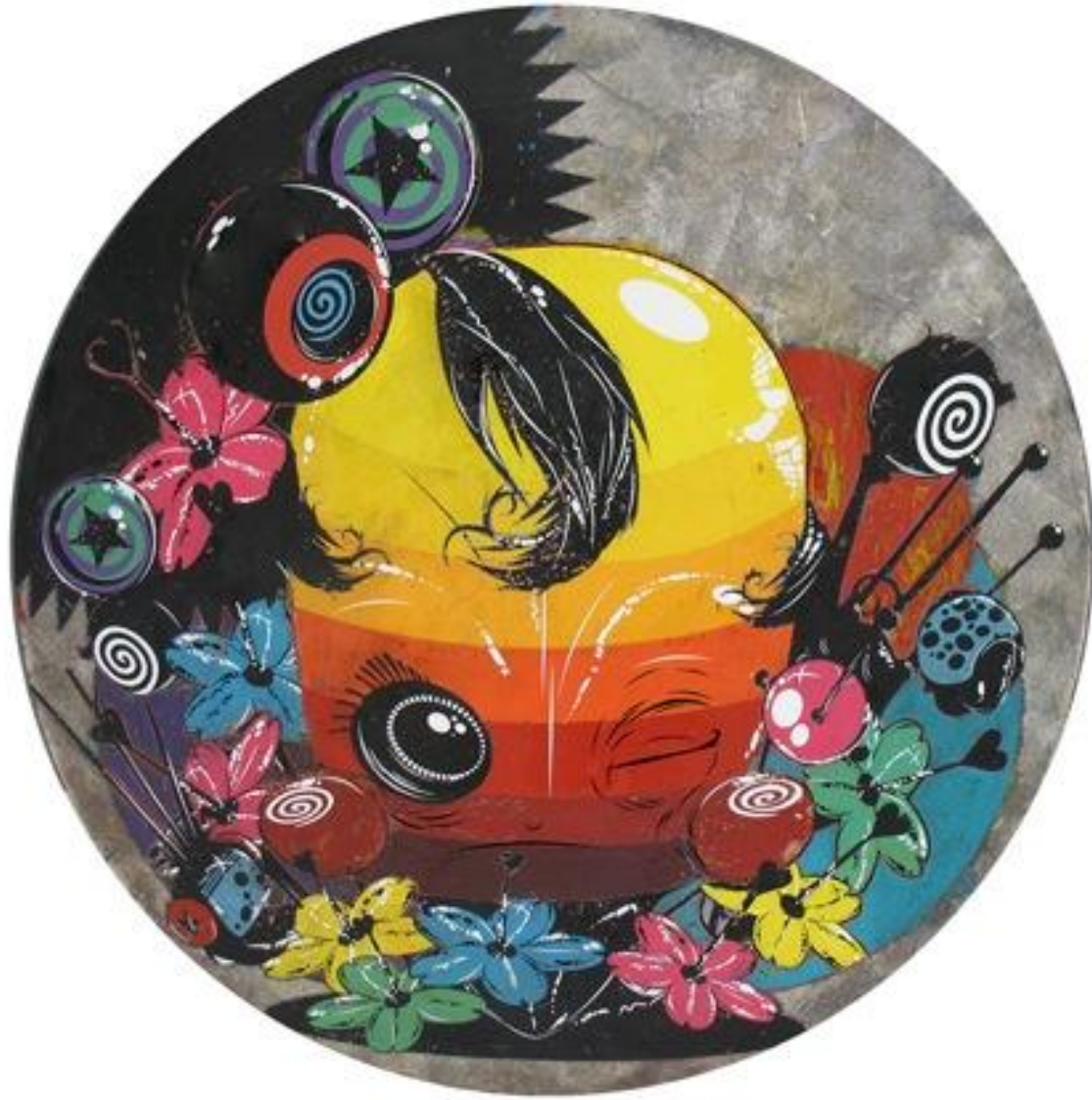
PHUNK | Daydreamer 9 | 2012 | Acrylic on Canvas | D: 100cm

ART SEASONS Singapore | Beijing | Jakarta