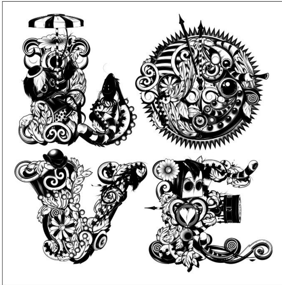
PHUNK | L.O.V.E. (Universal) | 2012 | Silkscreen on canvas with diamond dust | 120 x 120 cm

ART SEASONS Singapore | Beijing | Jakarta