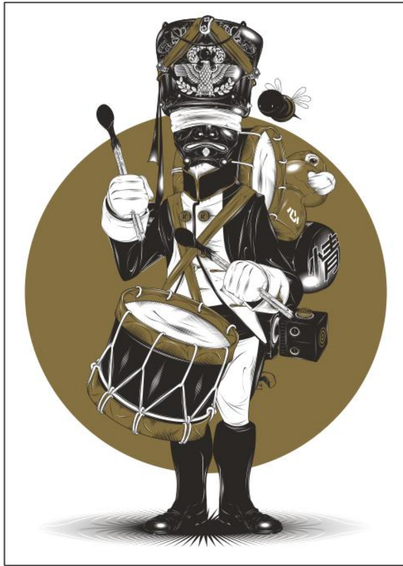
PHUNK | Army of Love (Golden) | 2012 | Silkscreen on canvas with diamond dust | 140 x 100 cm

ART SEASONS Singapore | Beijing | Jakarta