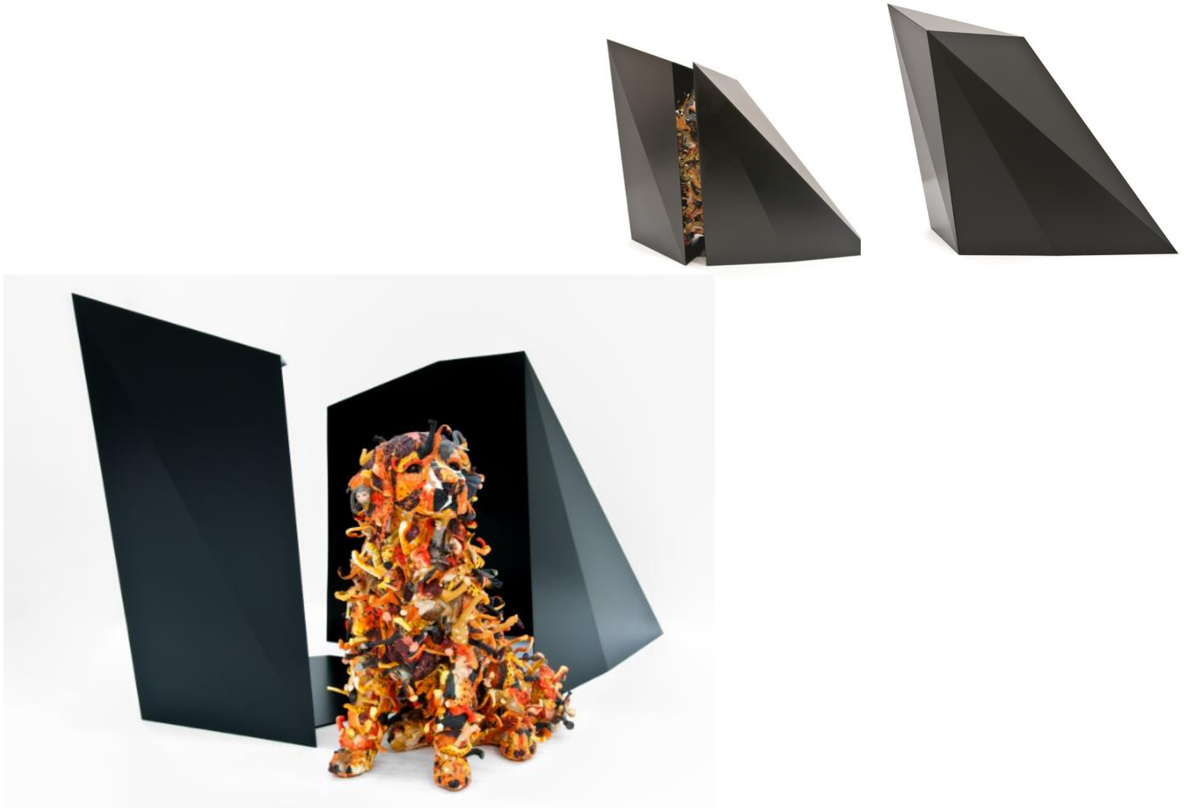
David Chan, Fetch , Assorted rubber animals and fiber glass with sheet metal casting, H61 x L69 x W46cm, 2014