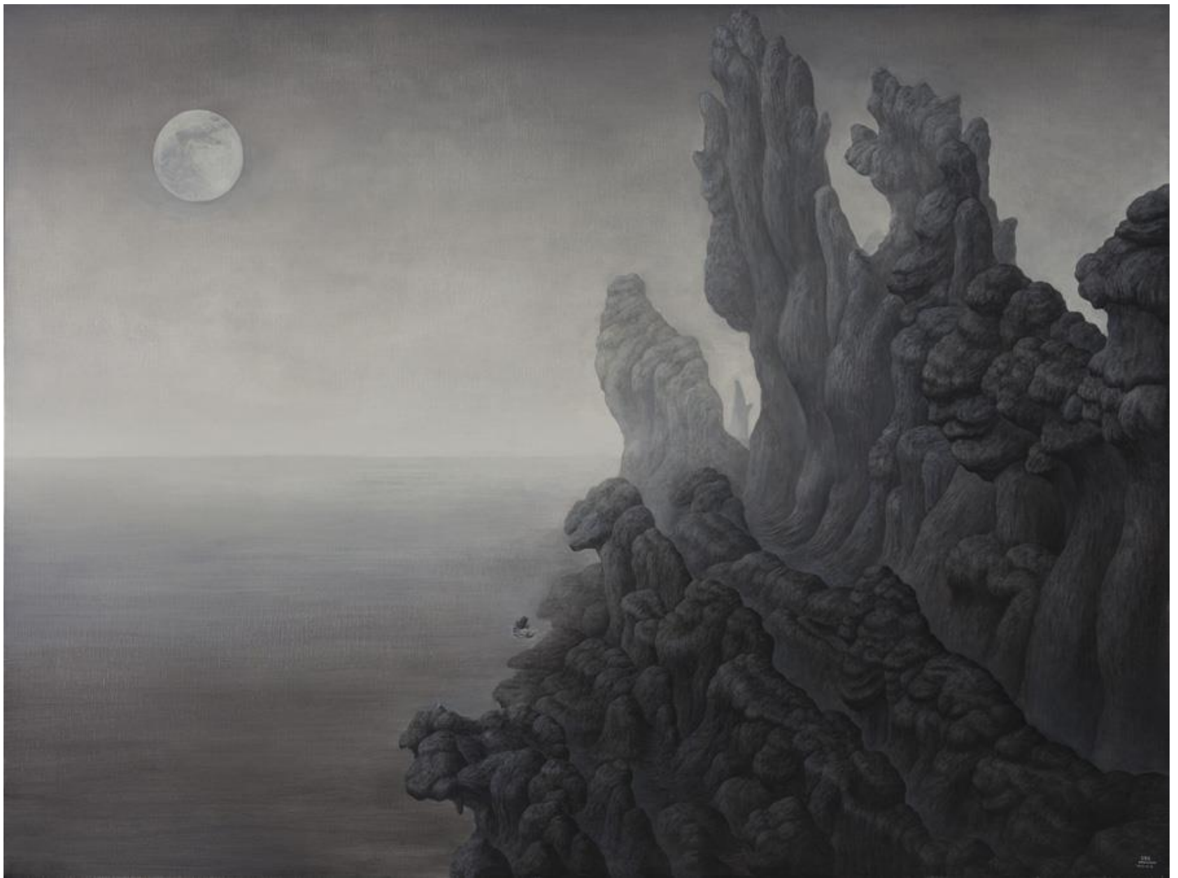
Wang Fanseng 王梵僧, Watch up the Moon 通天望月, Acrylic on Canvas, 160 x 120 cm, 2014