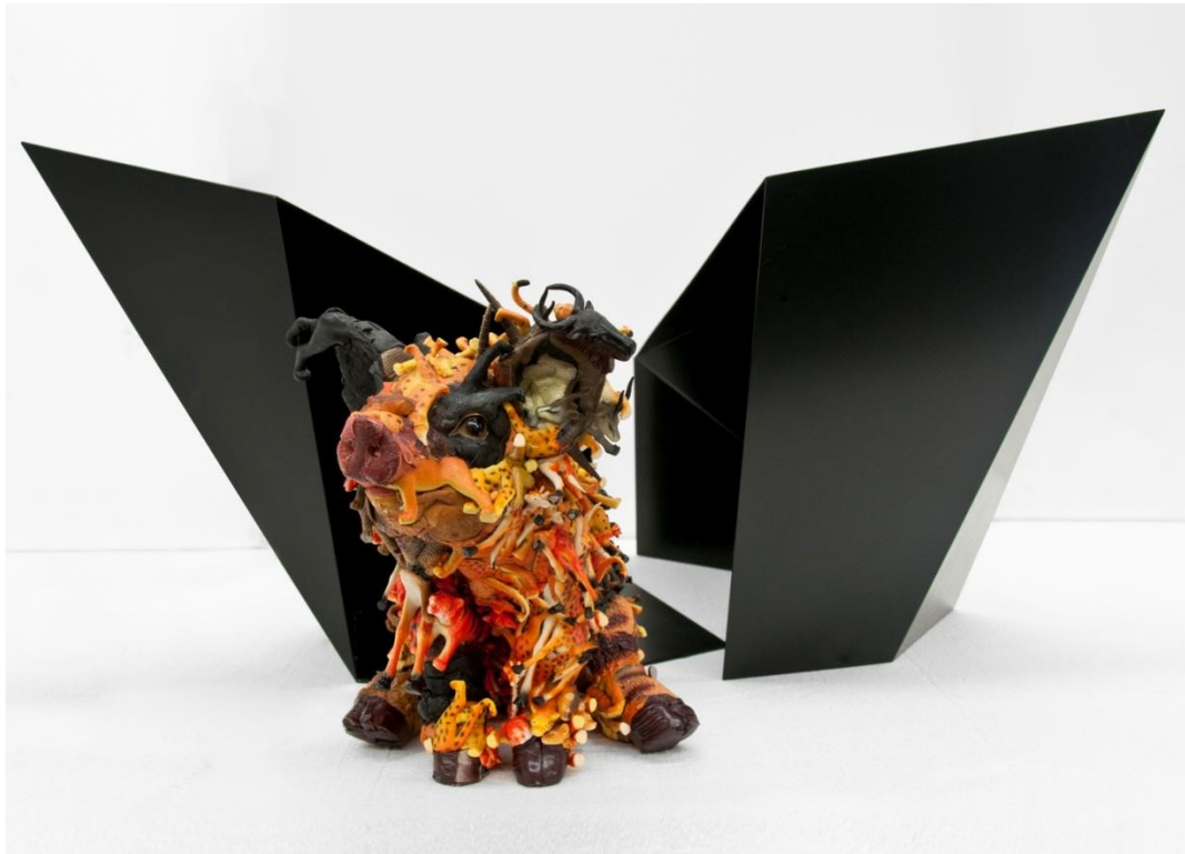
David Chan, Wilbur , Assorted rubber animals and fiber glass with sheet metal casting, H45 x L65 x W53cm, 2014