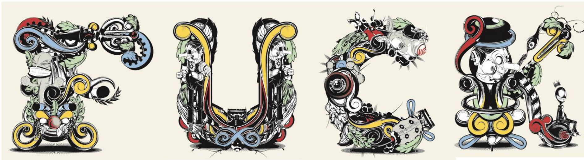
PHUNK, F. U. C. K. in A0 , Giclee print on Canvas, 118 x 84 cm (Set of 4 Canvas), 2015