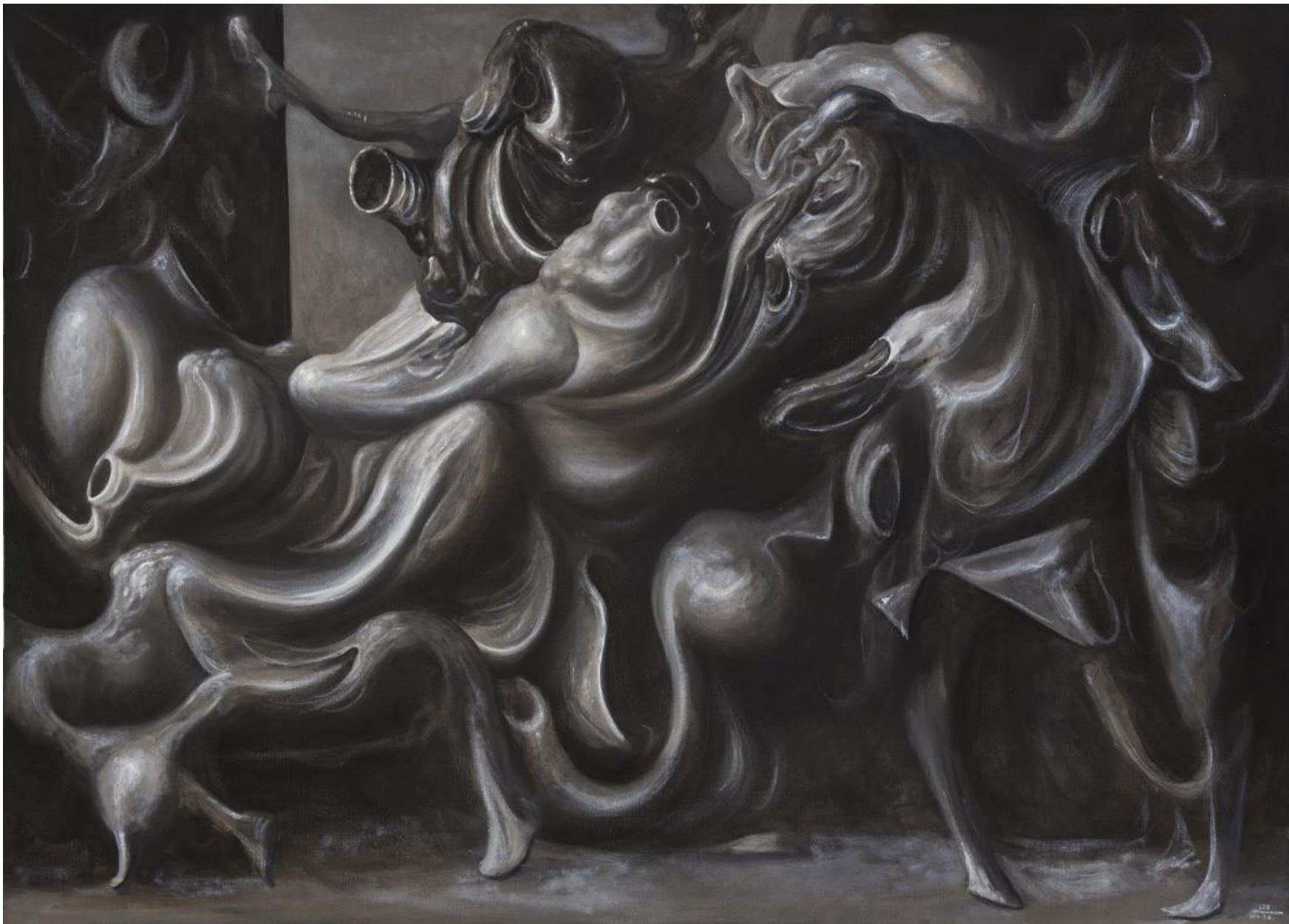
Wang Fanseng 王梵僧, Phantom of a Dance 舞魂, Oil on Canvas, 100 x 140 cm, 2014