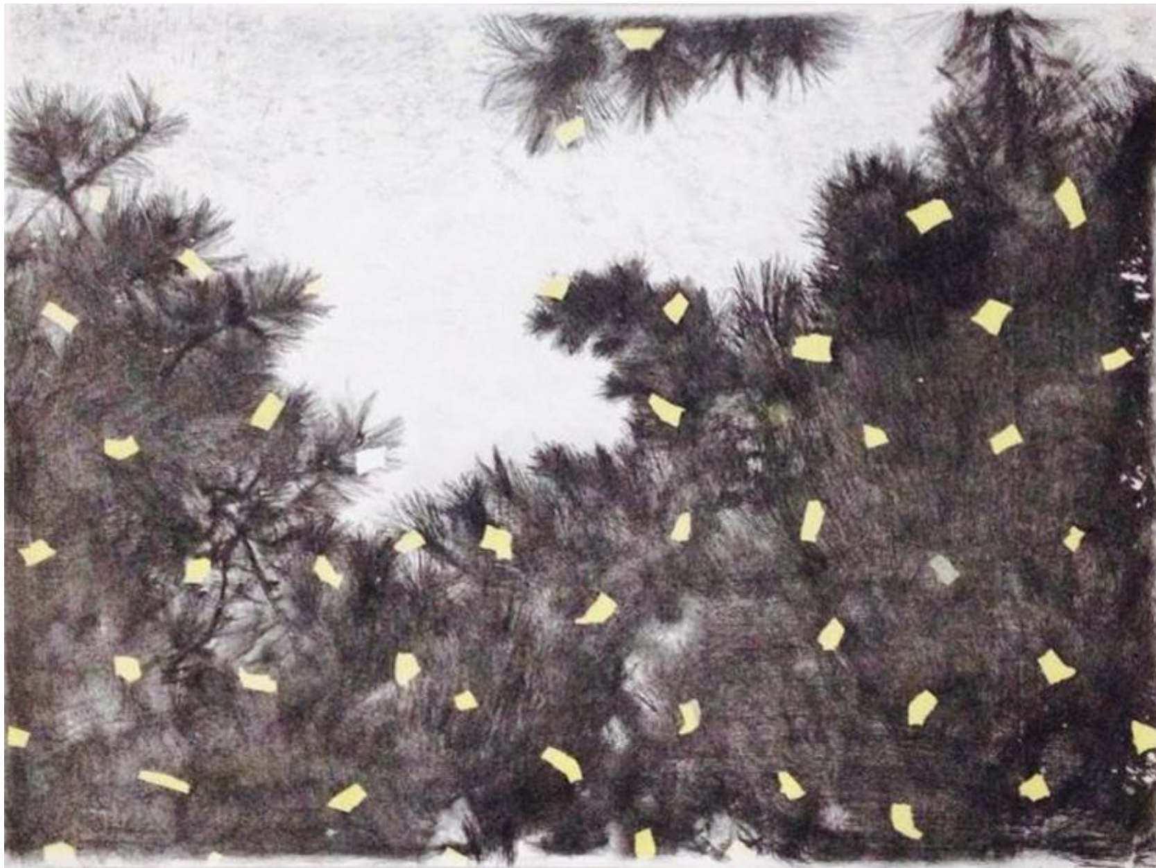
Yu Aijun 于艾君 , Treetop I 树丛之一, Oil on Paper, Ink & Wax 纸上油彩、油墨、蜡 , 103 x 134 cm, 2014