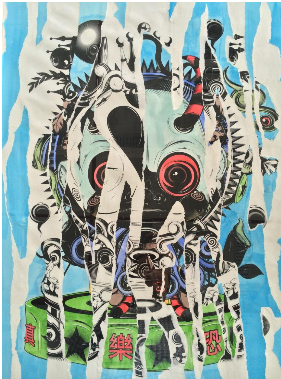
PHUNK, Day & Night IV , Mixed Media Silkscreen Ink and Acrylic Paint on Mi-Tientes Paper, 84.1 x 59.4 cm, 2014