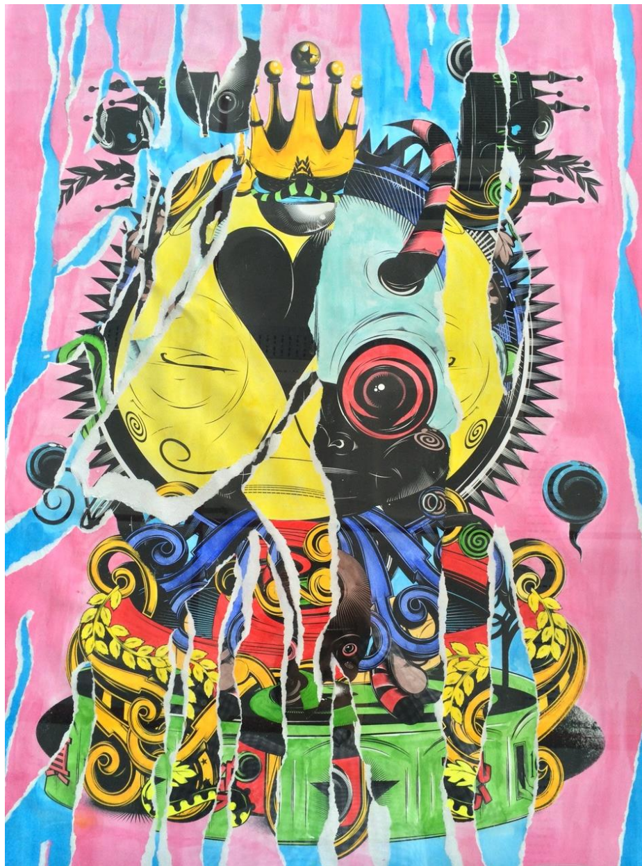
PHUNK, Day & Night III , Mixed Media Silkscreen Ink and Acrylic Paint on Mi-Tientes Paper, 84.1 x 59.4 cm, 2014