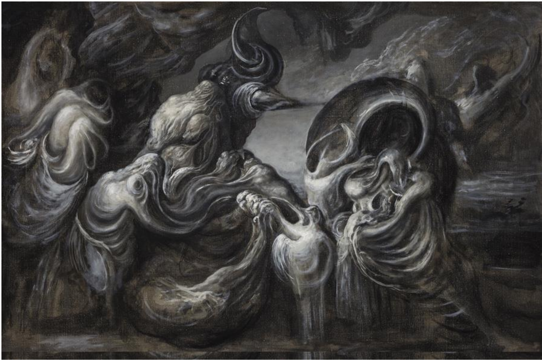
Wang Fanseng 王梵僧, Insect Humming 虫吟, Acrylic on Canvas, 80 x 120 cm, 2014