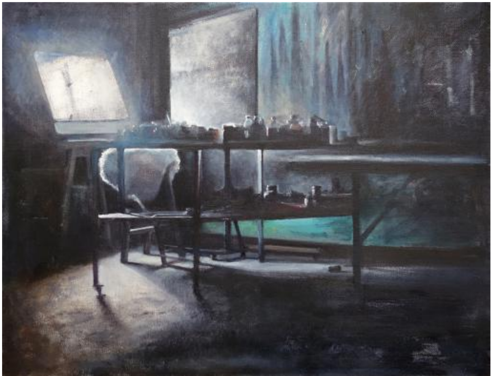
Zhu Xinyu 朱新宇, The 丌E Composition 丌E , Oil on Canvas 布面油画, 60 x 80 cm, 2013