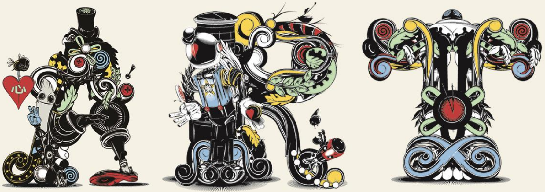
PHUNK, A. R. T. in A0, Giclee print on Canvas, 118 x 84 cm (Set of 3 Canvas), 2015