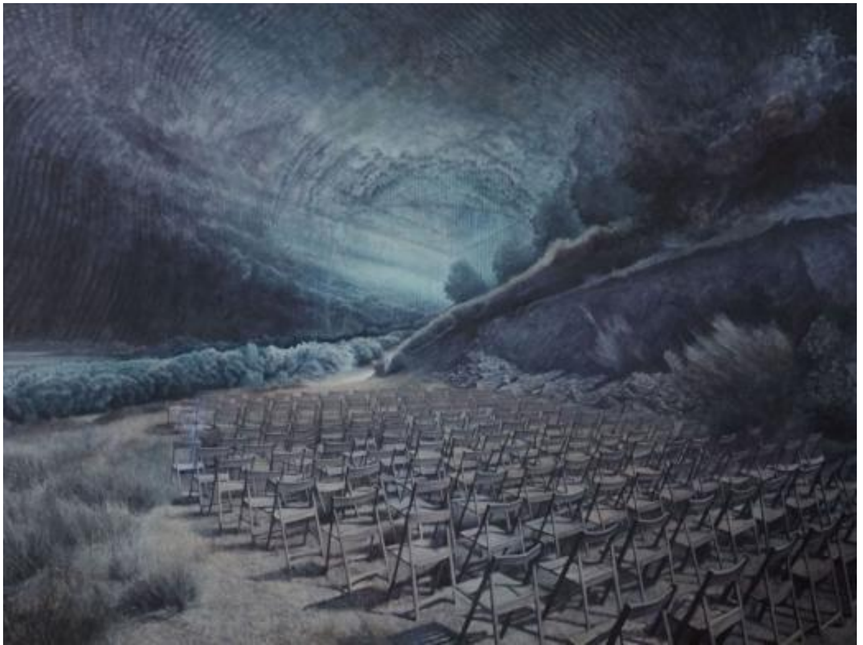
Zhu Xinyu 朱新宇, The Floating Non-Ash Flower 花飞灰非花, Oil on Canvas 布面油画, 300 x 400 cm, 2013