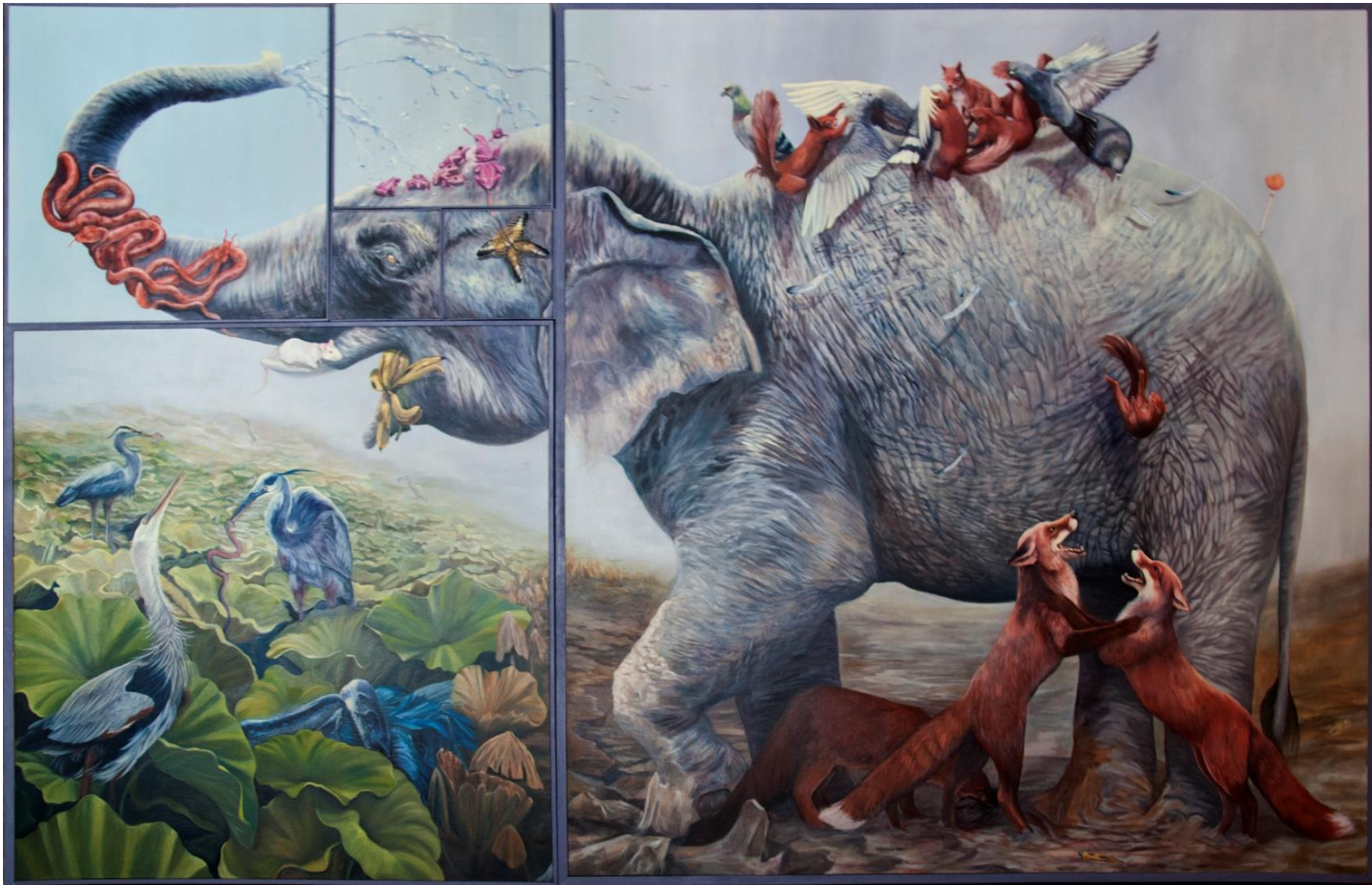
David Chan, Blind Occurrences , Oil on Linen, 200 x 325 cm (Set of 6 Canvas), 2015