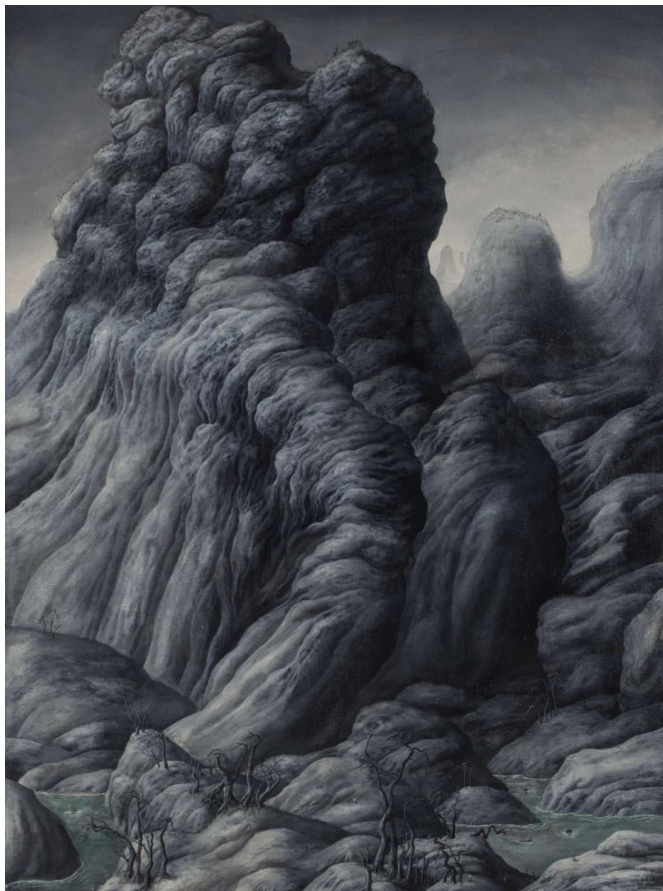
Wang Fanseng 王梵僧, Mountain Forests 虬林万壑, Acrylic on Canvas, 100 x 75 cm, 2011