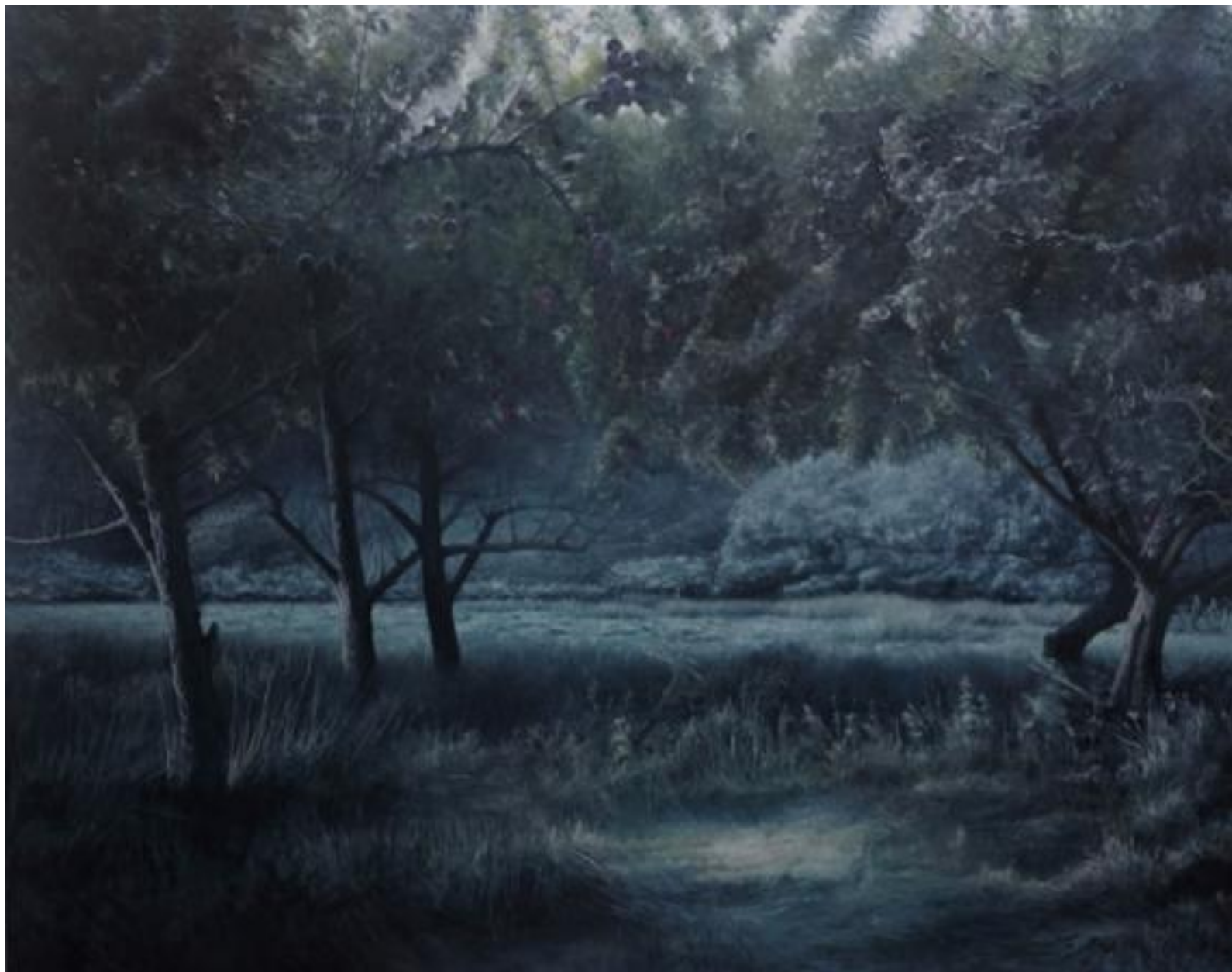
Zhu Xinyu 朱新宇, A Red Journey in Green 红旅于绿, Oil on Canvas 布面油画, 200 x 250 cm, 2014