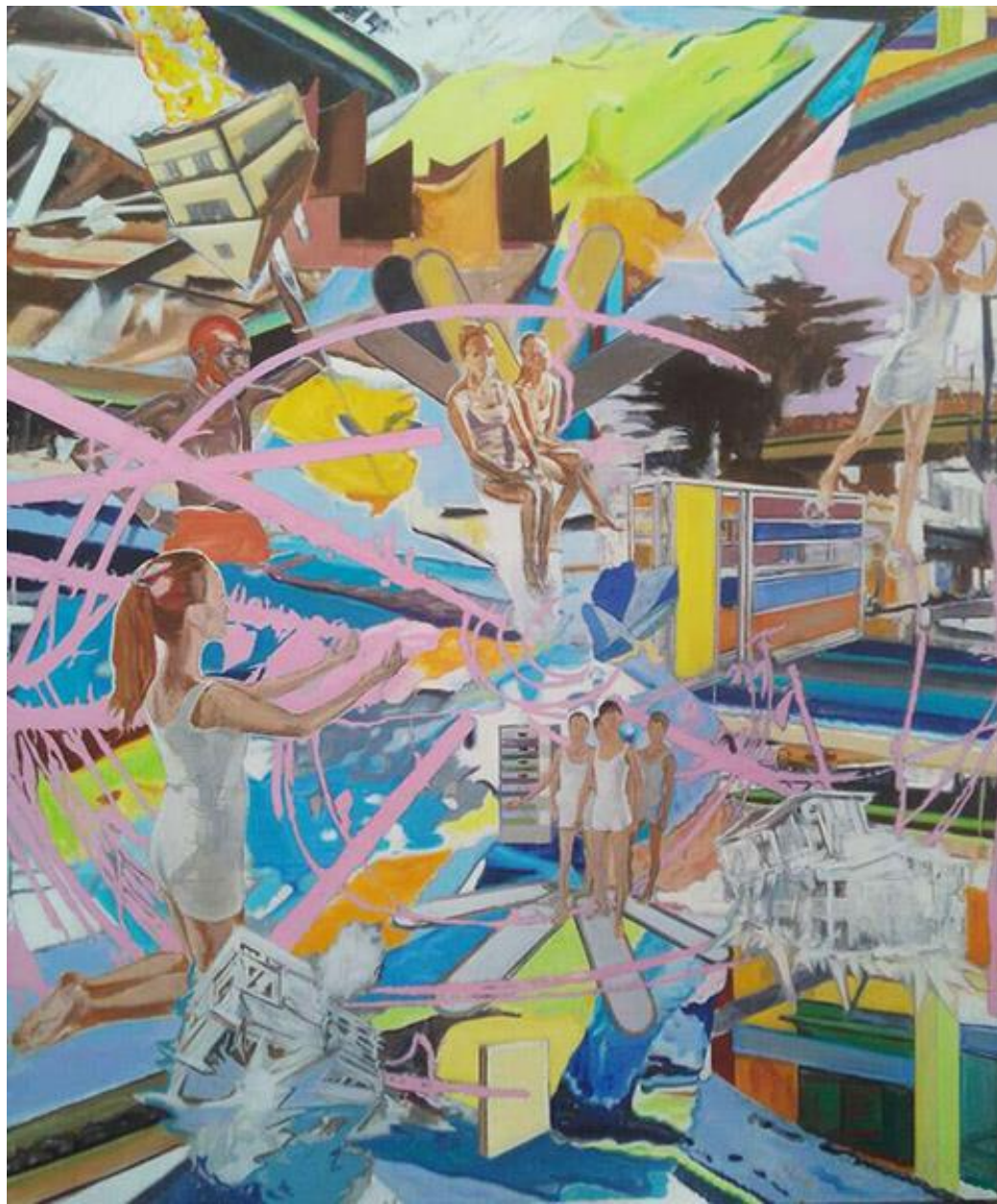
Wan Zhenyu 万真宇, Swirl No. 1 娑婆 1, Oil on Canvas 布面油画, 155 x 130 cm, 2015