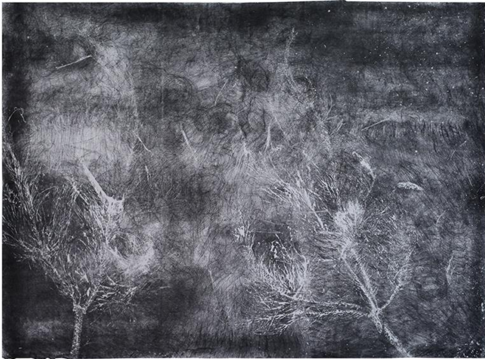
Yu Aijun 于艾君 , Two Pine Branches with Adjacent Shoots 末梢靠近的两个松枝 , , Oil on Paper, Ink & Wax 纸上油彩、油墨、蜡 , 125.5 x 61 cm, 2014